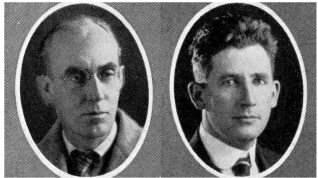
Charles W. Cobb and Paul H. Douglas

Plot of Vector Field F(x, y) = (-y^2, 2x^2) Maple Command: fieldplot([-y 2 , 2x 2 ], x = -3 .. 3, y = -3 .. 3, color = magenta